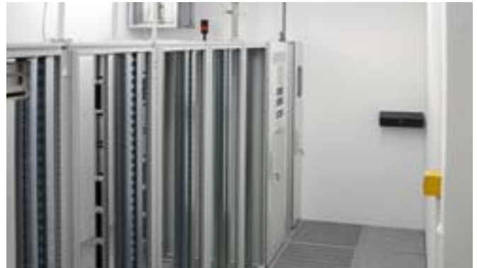
Optional: 19" rack system, UPS, fire alarm/extinguisher system, power distribution, sun protection.