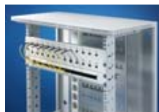
VerticalBox with mounting kit and mounting angles (for 10 U installation)