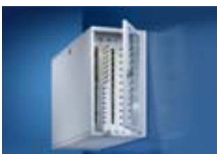
VerticalBox as wall-mounted enclosure