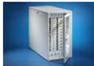
VerticalBox as floor-standing enclosure