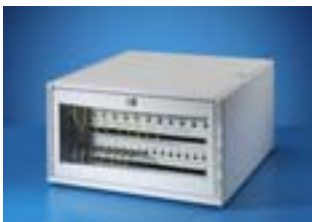
VerticalBox as instrument case